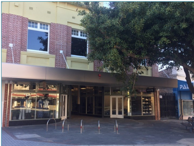
Photograph 1: Entrance to Atwell Arcade