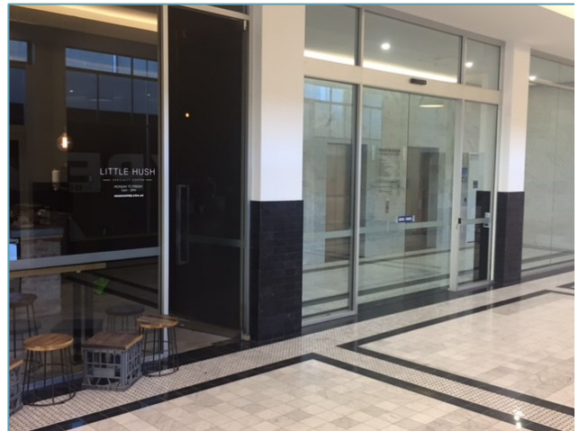
Photograph 2: Glass doors to lifts and Floor 1